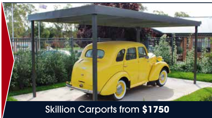
Skillion Carports from $1750