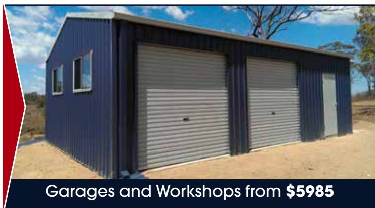
Garages and Workshops from $5985