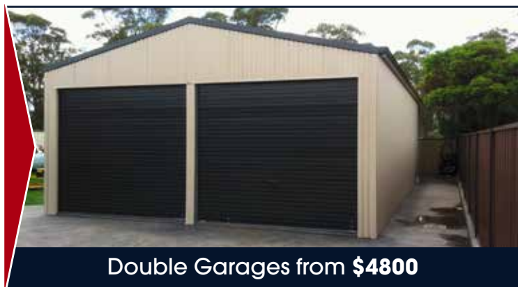
Double Garages from $4800